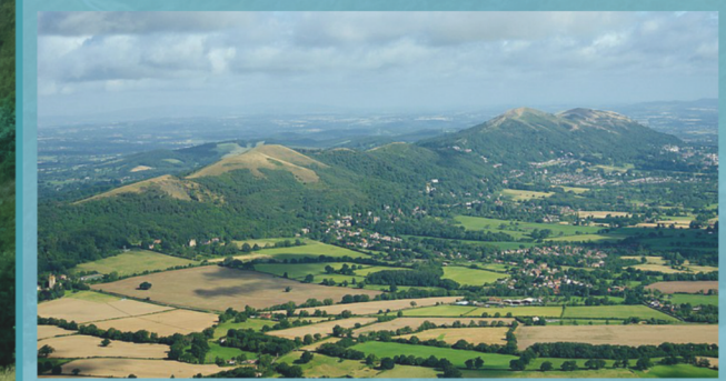
Vale of Evesham and Malvern Hills